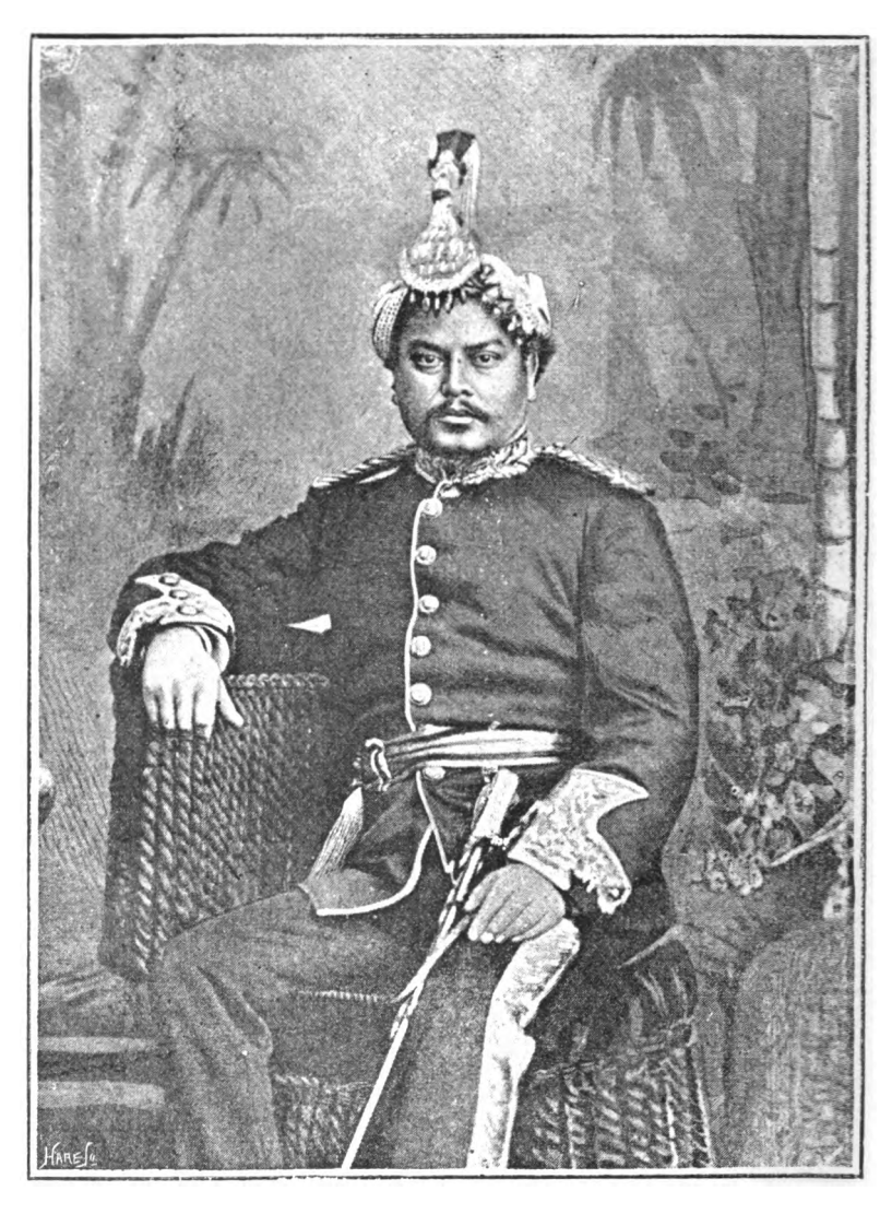
GENERAL DHOJE NURSING RANA BAHADUR.