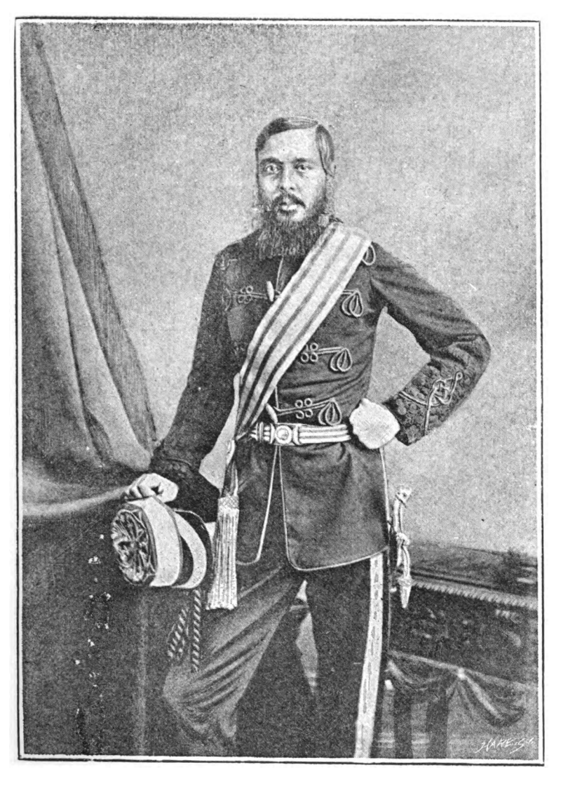
GENERAL JUGGUT JUNG RANA BAHADUR, ELDEST SON OF SIR JUNG BAHADUR—MURDERED BY BIR SHUMSHERE.