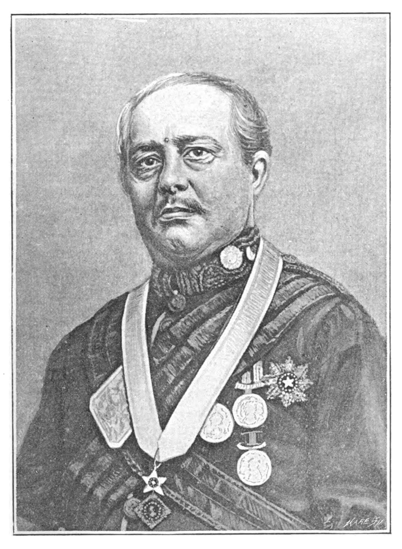
HIS EXCELLENCY MAHARAJAH SIR RANADIP SING RANA BAHADUR. K.C.S.I., etc., etc., late Prime Minister of Nepal.